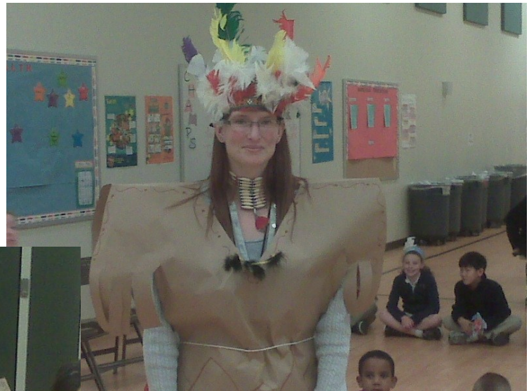
First Grade Teachers and Students demonstrate their Native American costumes.